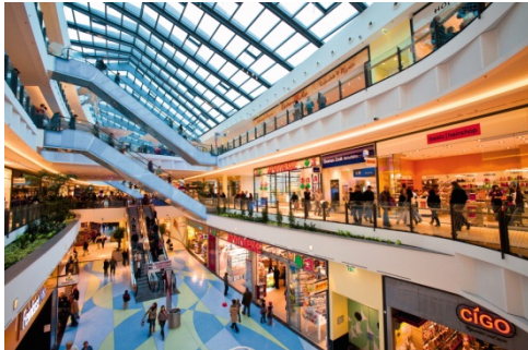
Loop 5 shopping mall in Weiterstadt, Germany.