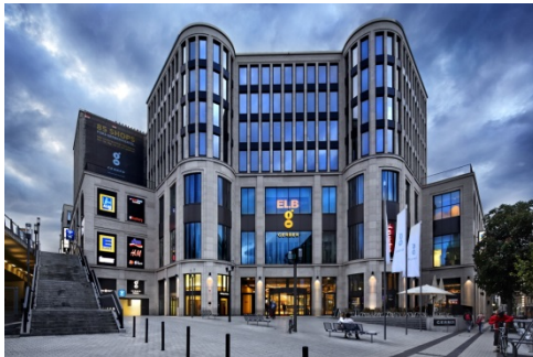
Gerber shopping centre in Stuttgart, Germany.

TROX is leading in the development, manufacture and sale of components, units and systems for the ventilation and air conditioning of rooms. With 29 subsidiary companies in 28 countries on 5 continents, 14 production facilities, and importers and representatives, TROX is present in over 70 countries. Founded in 1951, global market leader TROX, whose international head office is in Germany, generated in 2015 with a total of 3,700 employees around the globe revenues of €482 million.